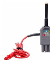
WS-07 adapter for measuring Z(L-N) loop