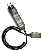
WS-03 adapter with START button (UNI-Schuko plug)