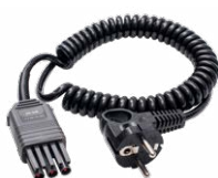
WS-04 adapter (UNI-SCHUKO angular plug)