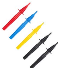
Pin probe (banana socket) red / blue / yellow / black B1 / black B3

WASONREOGB1 WASONBUOGB1 WASONYEOGB1 WASONBLOGB1 WASONBLOGB3