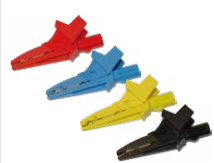
Crocodile clip red / blue / yellow / black

WASONREOGB1 WASONBUOGB1 WASONYEOGB1 WASONBLOGB1 WASONBLOGB3