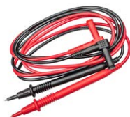
Test lead with probe for CMM/CMP (set)