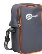
M13 carrying case