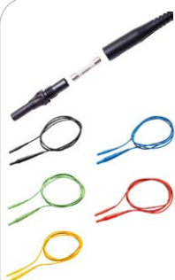
Test lead 2 m with 10 A fuse CAT IV 1000 V black / blue / green / red / yellow

WAPRZ002BLBBF10 WAPRZ002BUBBF10 WAPRZ002GRBBF10 WAPRZ002REBBF10 WAPRZ002YEBBF10