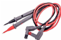
Set of test leads CAT IV, M